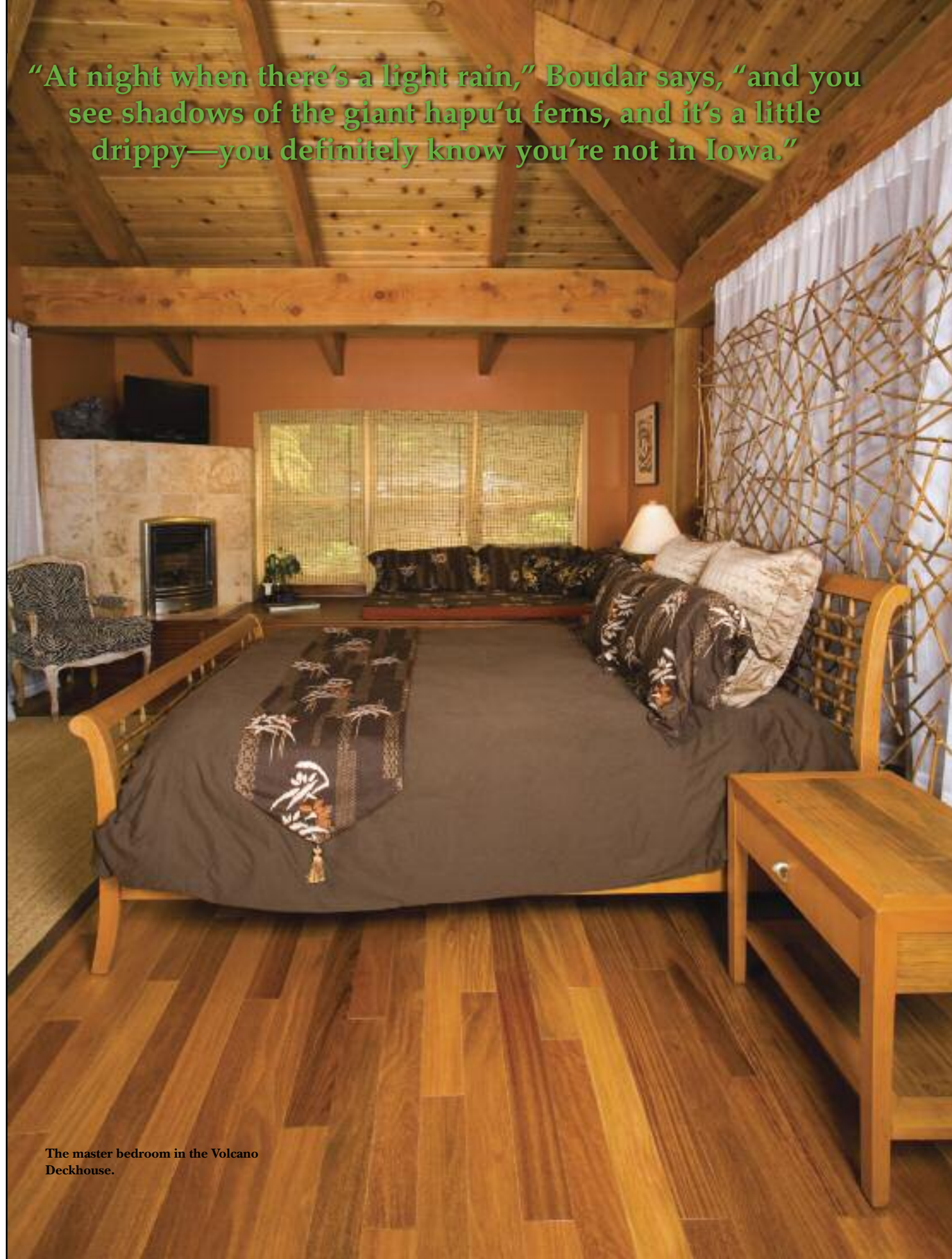
The master bedroom in the Volcano Deckhouse.

“At night when there’s a light rain,” Boudar says, “and you see shadows of the giant hapu’u ferns, and it’s a little drippy—you definitely know you’re not in Iowa.”