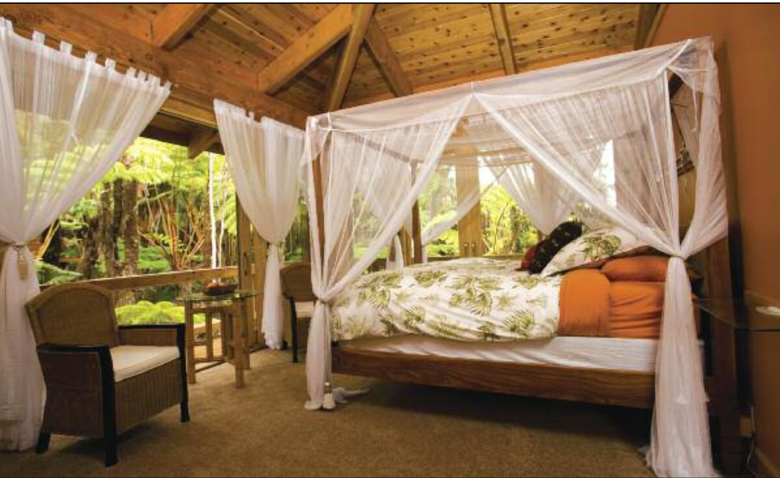
ABOVE: The Haiku Garden Suite with its view of, and lānais adjacent to, the rainforest. The four poster beds are layered with organic cotton sheets and down comforters atop thick “memory foam” toppers nestled upon very comfortable mattresses.

that stands alongside a complimentary bottle of wine.