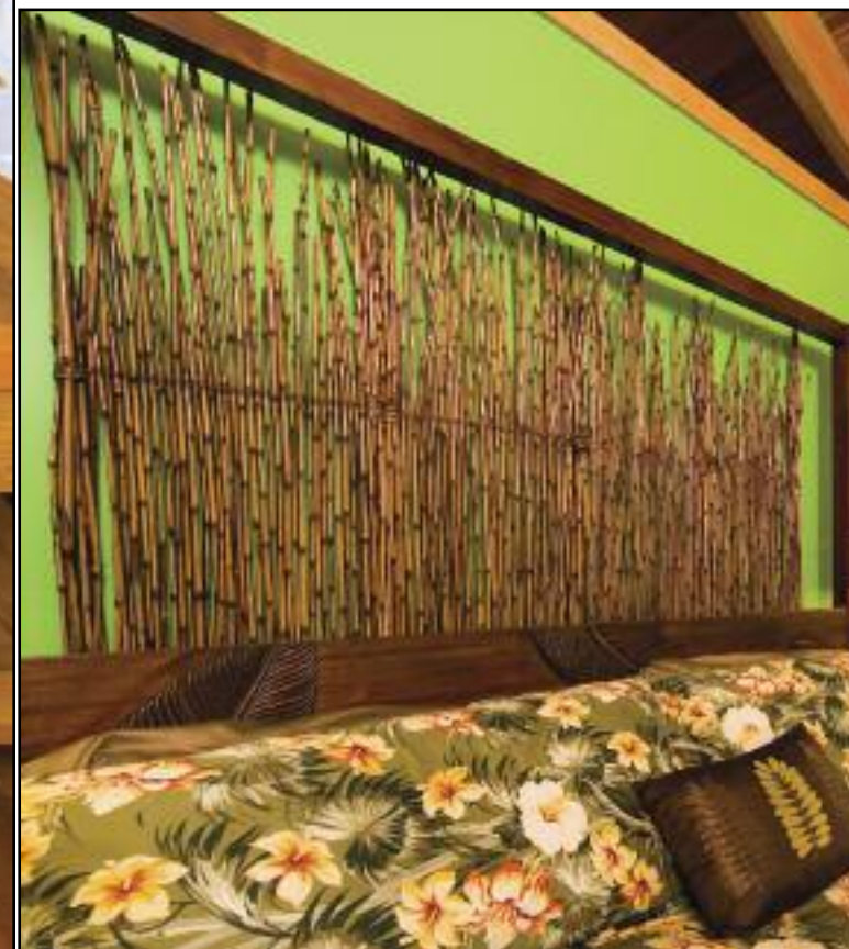
LEFT: The headboard is made with thin bamboo reeds bound together.

dows everywhere, and two walls with doors that open completely, privately, to the Volcano forest, where bursts of tropical orchids bloom out of hapu’u ferns. Boudar also rents out the lovely, larger space across from the guest suites that she calls the Volcano Deckhouse.