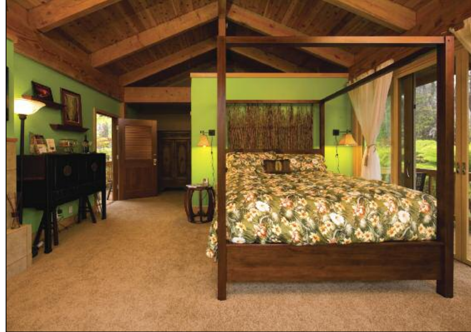
ABOVE: The Nahelelani Suite, with plush comfort inside and gorgeous views outside. In both guest suites, doors on two walls open to wrap-around lānais and private forest views.