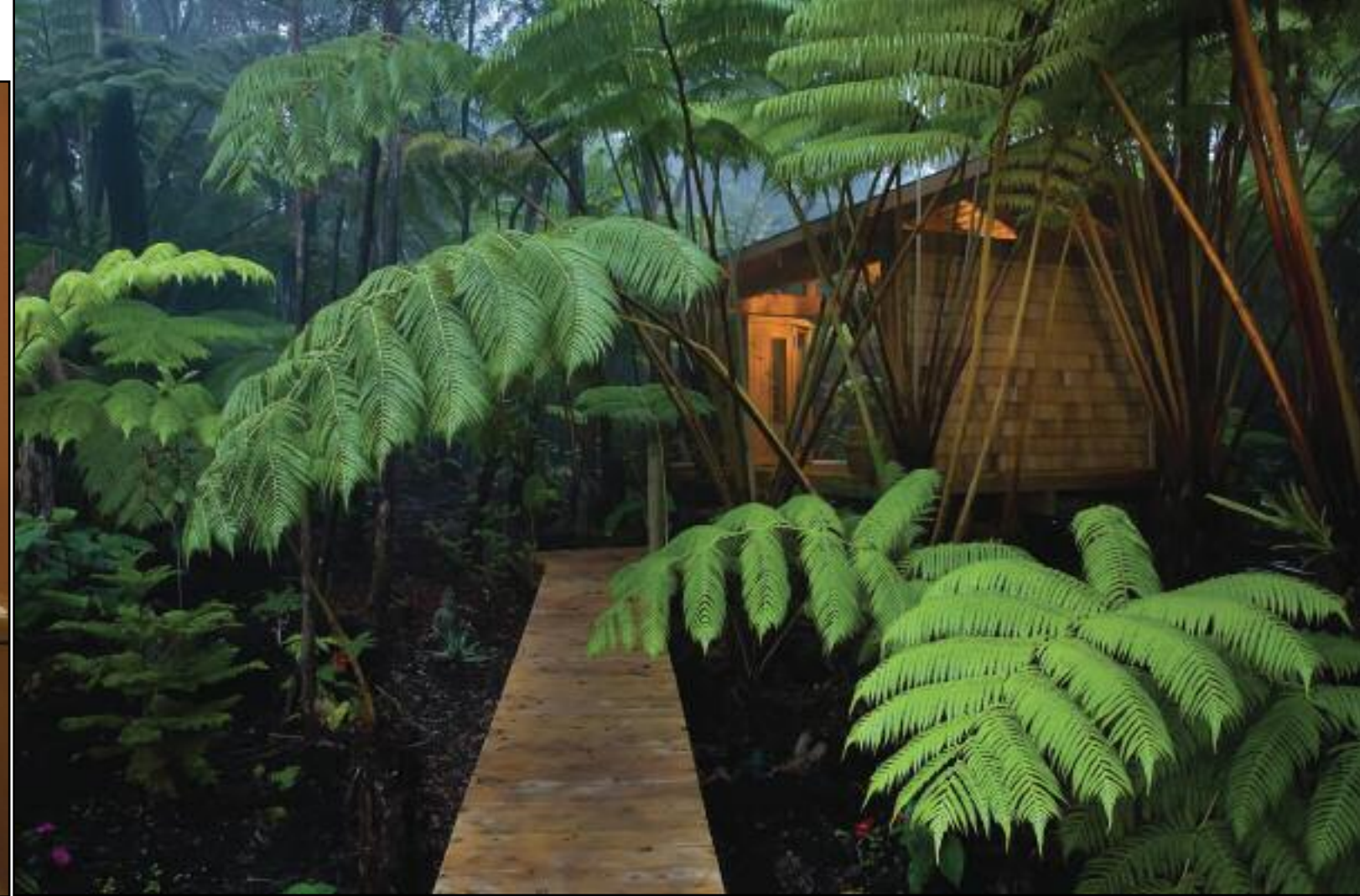
ABOVE AND BELOW: The cedar pathway, which seems to float above the forest floor, leads to an infrared sauna and hot tub.

“I have enough,” she says. “I want to take part of what I have